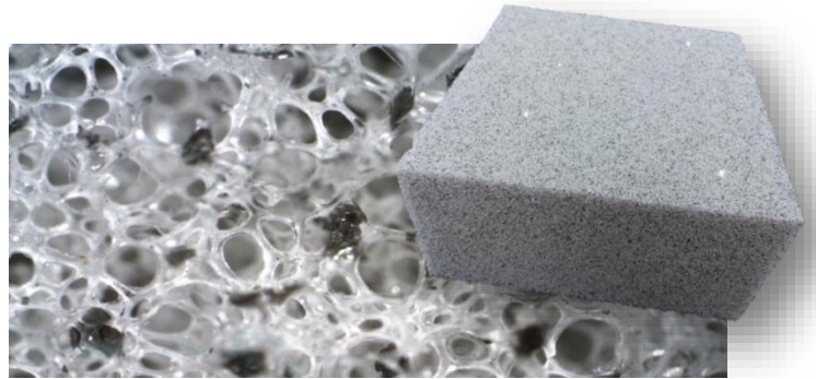
Open-Cell Black Diamond™ Visco

Mattress toppers and surface layers, molded pillows, quilting foam, other comfort products